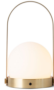
Brushed Brass 4863839