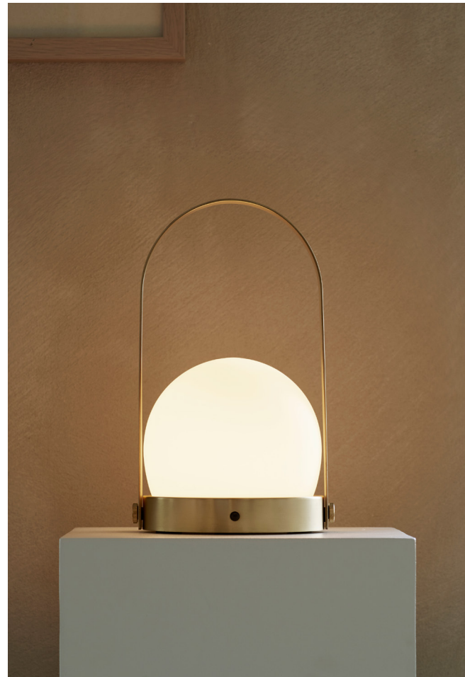
Carrie Table Lamp, Brushed Brass, by Norm Architects