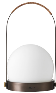
Bronzed Brass 4863859